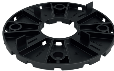
PSTSB 02 spacer thickness 2 mm